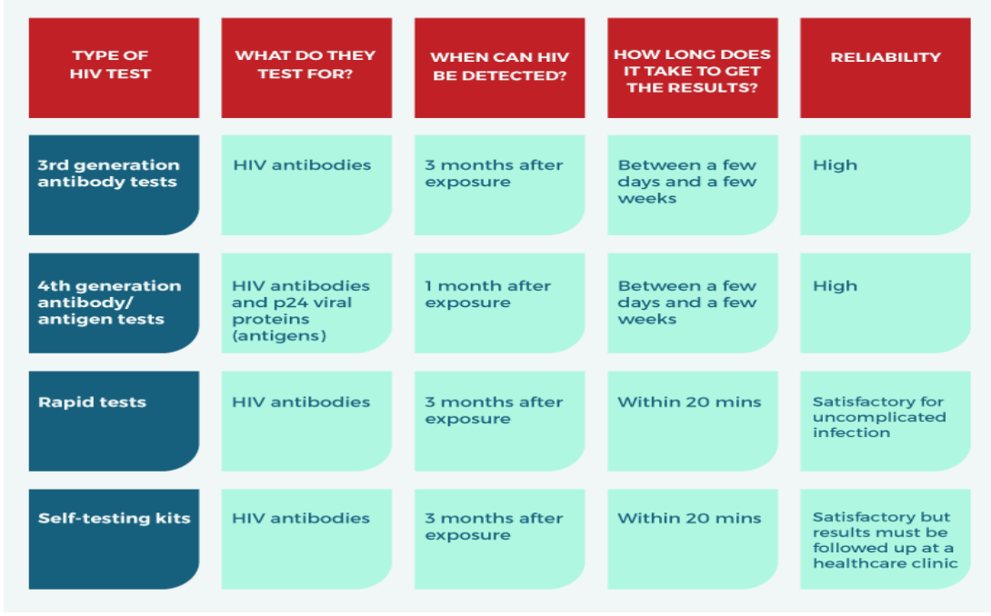
Figure 3. Types of HIV Tests

HIV testing is more complete with different approaches. Blood donors can be tested using ELISA, RDT, NAT, and CLIA to balance their strengths and weaknesses. Tiering can improve early infection detection, reduce false positives and negatives, and protect the blood supply. Planning and resource allocation are needed for screening process integration<sup>48</sup>. Comparing HIV screening methods in blood donors shows a complex combination of efficacy, sensitivity, specificity, and practicality. HIV screening benefits from ELISA's sensitivity and specificity, RDTs' speed and accessibility, NAT's early detection, and CLIA's efficiency. HIV prevalence, resources, restrictions, and setting dictate screening. HIV screening accuracy and dependability require continual training, quality assurance, and public health. New screening and testing methods will improve blood supply safety and reliability as technology advances. Public health officials must be alert, adaptable, and devoted to improving HIV screening for patient safety and public health. Comprehensive HIV screening is needed because transfusion-transmitted HIV is hazardous<sup>4950</sup>.